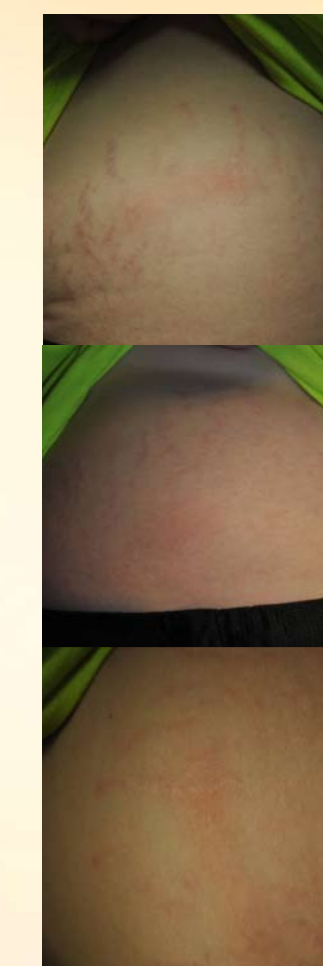
Figure 2. Indurated, erythematous, subcutaneous, tender nodules on the abdomen.