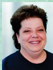
Theresa Kunkle Float Pool, LVH—Cedar Crest