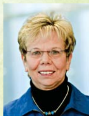
Mr. and Mrs. Abram Samuels Cardiovascular Nursing Award Mary Boyle Regional Heart Center—Medical