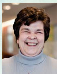
Award for Excellence in the Care of Geriatric Patients Carol Pollitt Transitional Skilled Unit