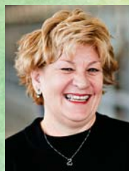
Kathleen Woolf Ambulatory Surgical Unit, LVH—Muhlenburg