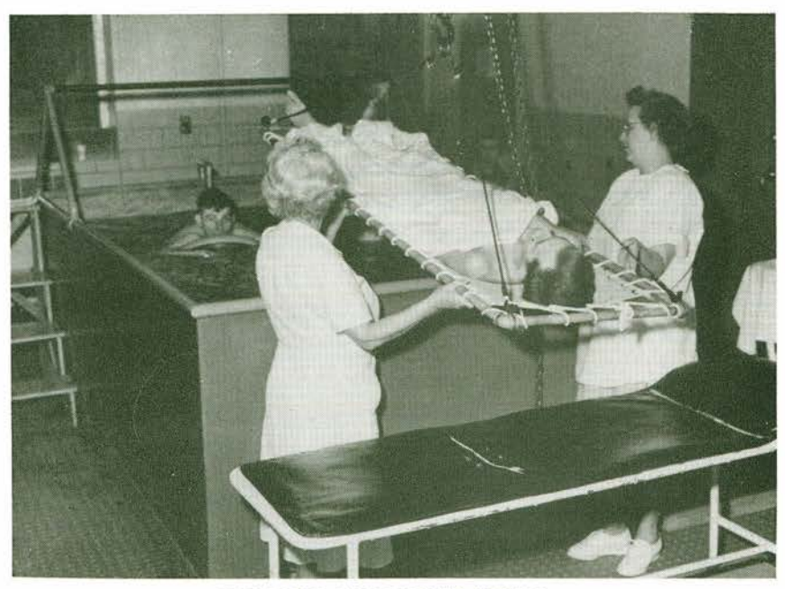
CRIPPLED CHILDREN'S CLINIC The warm water pool in the Crippled Children's Clinic is used many hours every day.

American traditions. Philadelphia is 53 miles to the South and New York 93 miles to the East. Within an hour's drive are the famed resorts of the Pocono Mountains. Temperatures vary from a Winter average of 29 degrees to a Summer median of 71. Cleanliness is a personal and community fetish.