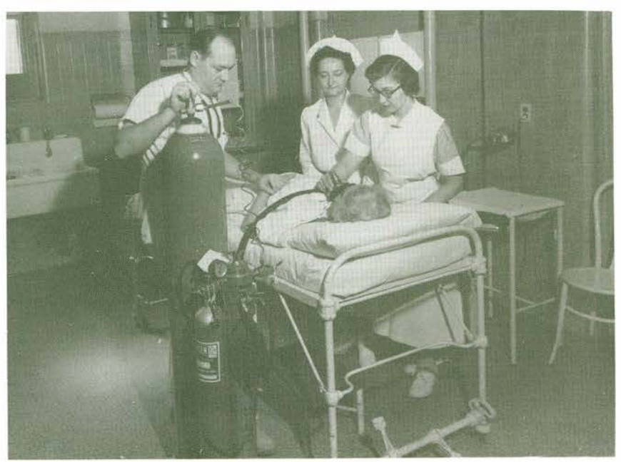
COMPLETELY EQUIPPED EMERGENCY ROOMS

It is to this community that the Allentown Hospital belongs and it is the people of this community whom it serves.