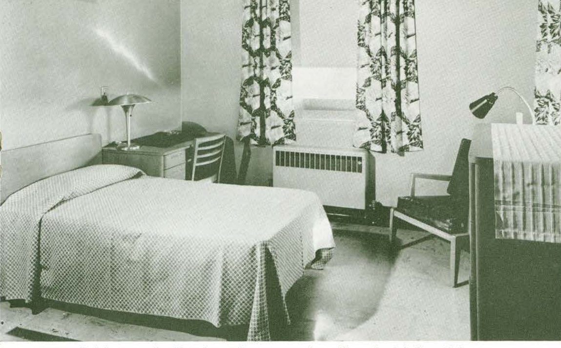
Each interne and resident has a private room such as this on the sixth floor of the new building. The entire floor is reserved for interns and residents.

practice their profession in the State. Its standards and practices, the outstanding qualifications of its staff, its carefully regulated and supervised educational programs, its broad diversification of service and its many admissions for every type of care won for it the approval of the Council on Medical Education and Hospitals for the training of interns and for the further training of residents, and the approval of the American College of Surgeons for graduate training in surgery or a surgical specialty.