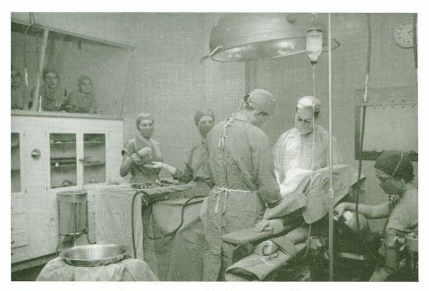
Operating room with observation gallery