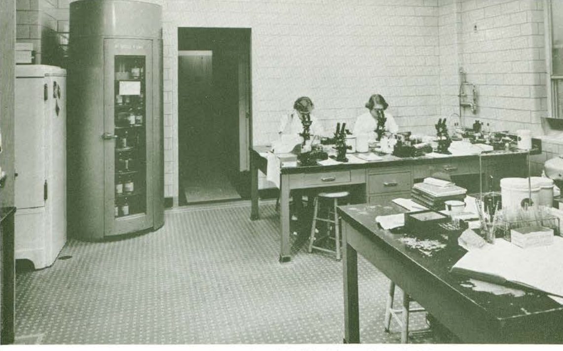
The Pathology Department has a series of adjoining laboratories, each of them designed and equipped for specific procedures.

Medical students interested in serving internships at the Allentown Hospital and those qualified for graduate residencies are invited to visit the Hospital and confer with the Intern Committee and other staff members.