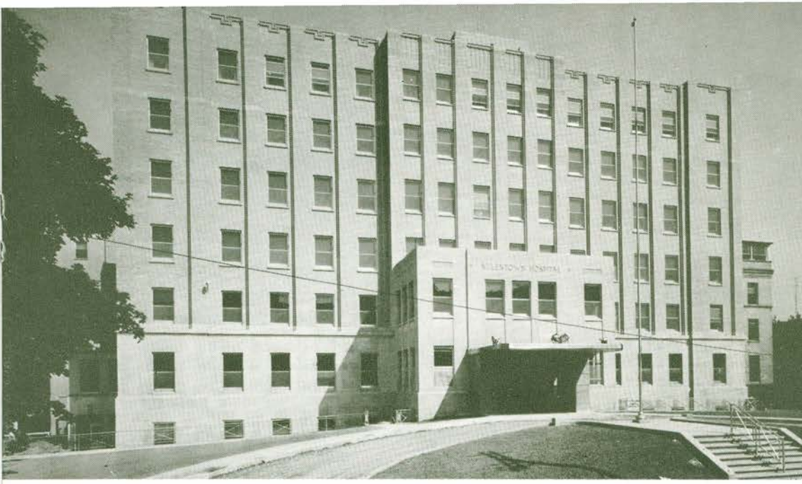
The new Central Administration and Patient Service Building