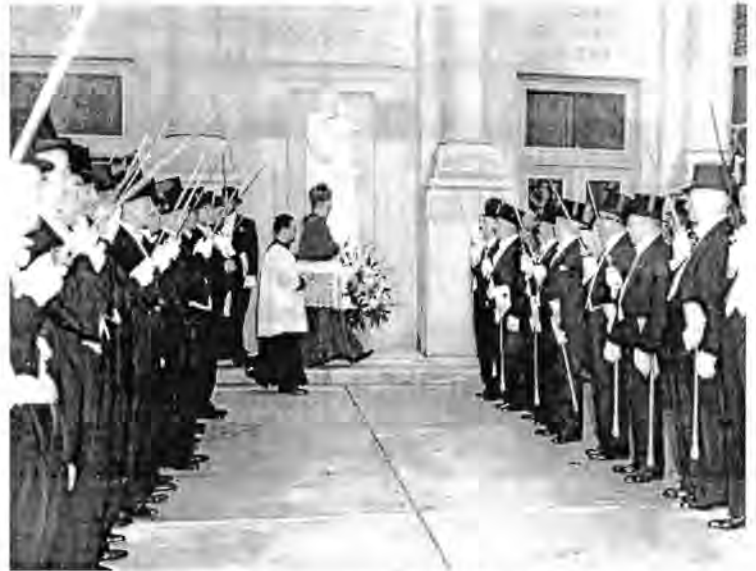
The dedication ceremonies of the Saint Joseph Hospital.