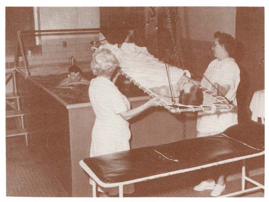
CRIPPLED CHILDREN'S CLINIC The warm water pool in the Crippled Children's Clinic is used many hours every day.

On its borders are some of the nation's most fertile and well kept farms and orchards. Close by are smaller urban and rural communities that, like Allentown, are intensely proud to be bulwarks of the finest American traditions. Philadelphia is 53 miles to the South and New York 93 miles to the East. Within an hour's drive are the famed resorts of the Pocono Mountains. Temperatures vary from a Winter average of 29 degrees to a Summer median of 71. Cleanliness is a personal and community fetish.