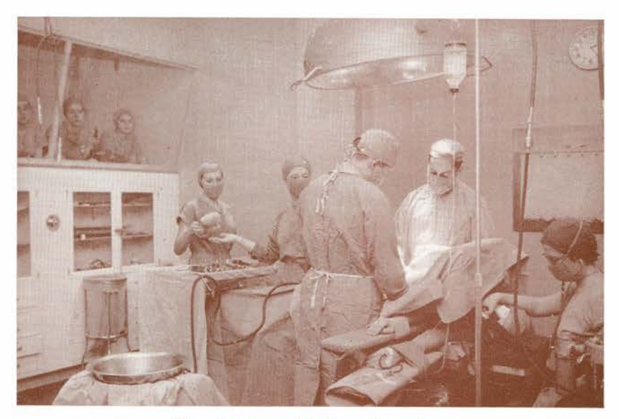
Operating room with observation gallery