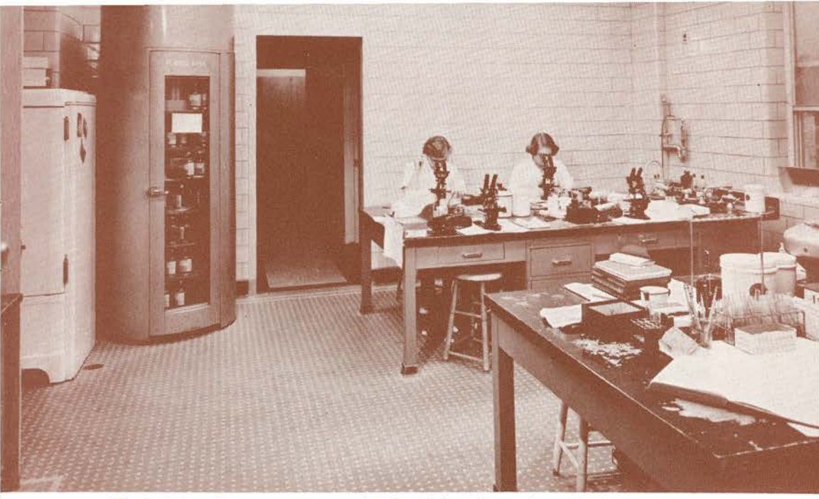
The Pathology Department has a series of adjoining laboratories, each of them designed and equipped for specific procedures.

Stipends and other allowances for internes and residents are in keeping with the area pattern.