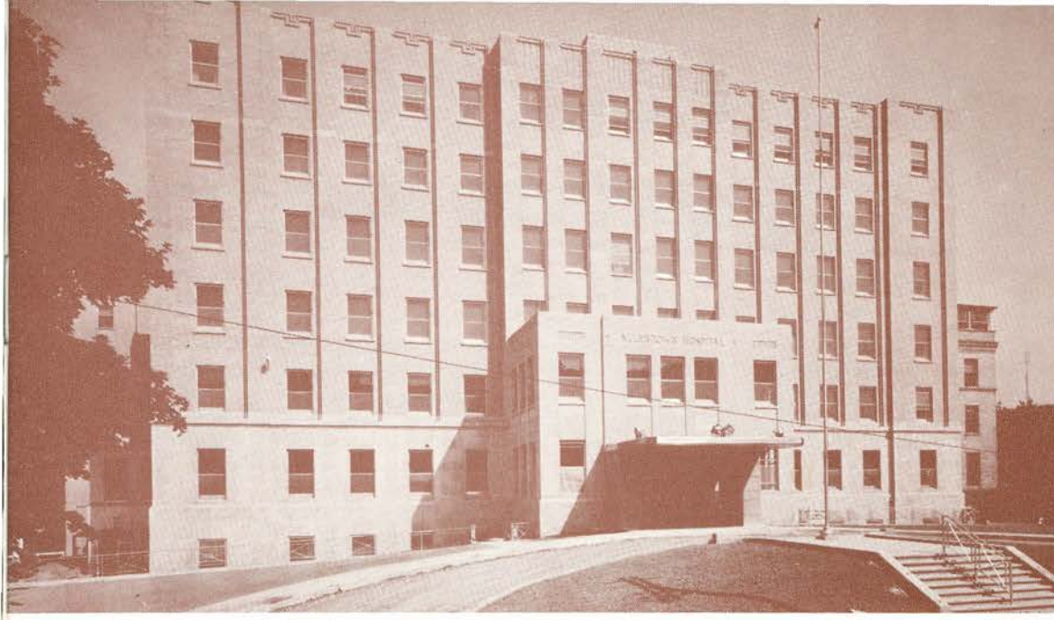
Central Administration and Patient Service Building