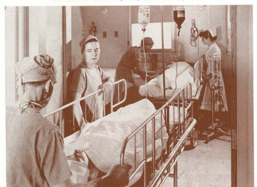
One corner of a modern post-operative recovery room.

It is to this community that the Allentown Hospital belongs and it is the people of this community whom it serves.