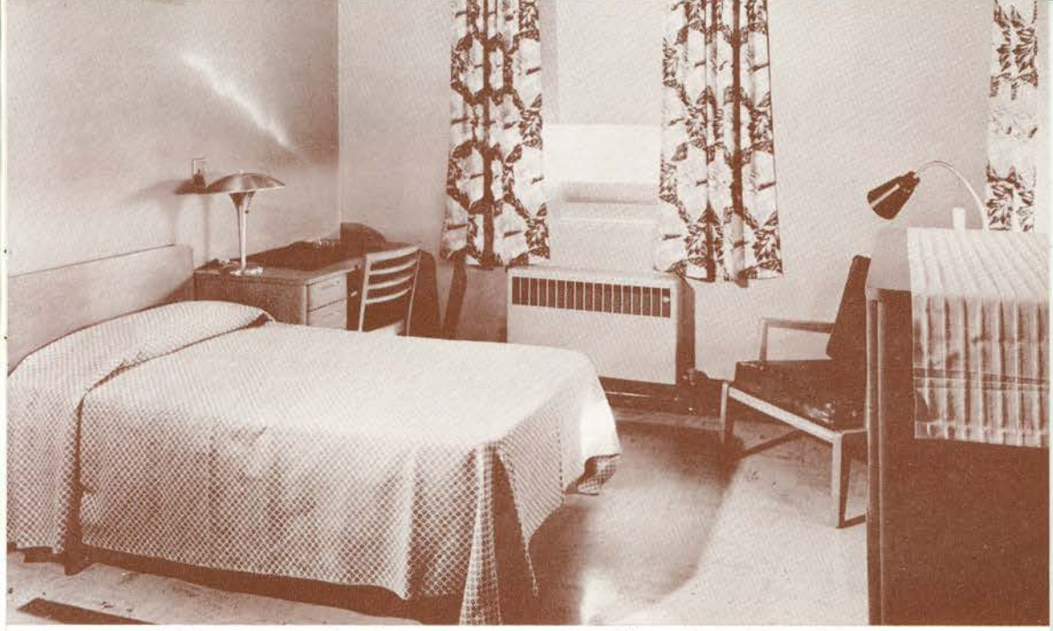
Each interne and resident has a private room such as this on the sixth floor of the new building. The entire floor is reserved for internes and residents.

The Allentown Hospital was among the first in Pennsylvania to be recognized as an interne training center when the State Board of Medical Education and Licensure in 1912 required graduates of medical schools to serve a period of interneship before becoming eligible to practice their profession in the State. Its standards and practices, the outstanding qualifications of its staff, its carefully regulated and supervised educational programs, its broad diversification of service and its many admissions for every type of care won for it the approval of the Council on Medical Education and Hospitals for the training of internes and for the further training of residents, and the approval of the American College of Surgeons for graduate training in surgery or a surgical specialty.