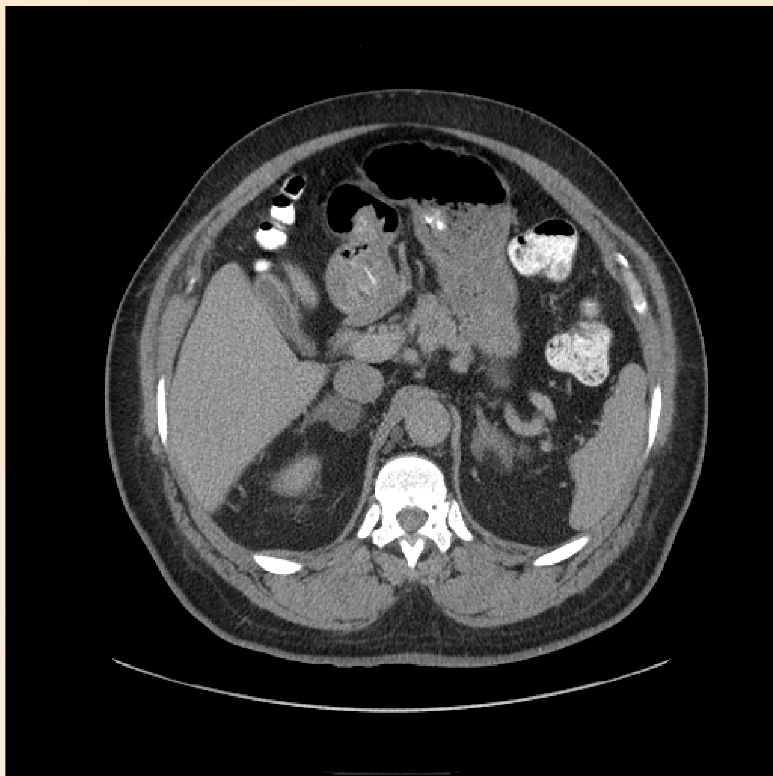
Figure: CT of Abdomen with contrast showing right adrenal nodular lesion and left adrenal limb thickening representing hyperplasia.