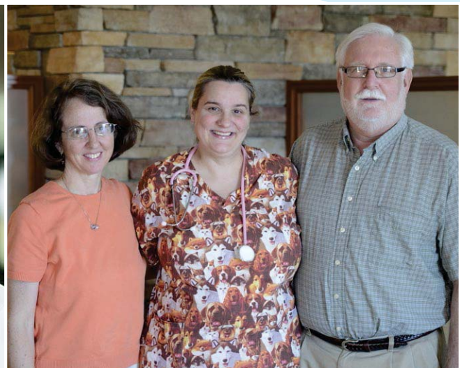
Inpatient Hospice Team

It takes a special kind of person to provide end-of-life care. Every day, the inpatient hospice team at Lehigh Valley Hospital–17th Street displays great sensitivity and compassion when patients and families need it most. On March 19, 2013, they needed it more than ever. Seconds after a distraught family member chose to end his and his spouse’s life on the hospice unit, team members swiftly took steps to ensure everyone’s safety. Without skipping a beat, they began comforting patients, families and each other. They also continued to deliver compassionate care under extremely difficult circumstances. It was an extraordinary display of courage, calm, dedication and professionalism.