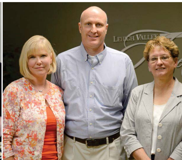
Home Care and Hospice