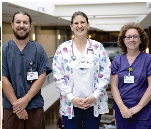
Perioperative Services LVH-Cedar Crest

The average length of stay for pediatric patients receiving same-day surgery was more than nine hours. Patients were being transferred to and from perioperative areas and occupying patient rooms in the inpatient pediatric unit. Colleagues in the surgical staging and post-anesthesia care units knew they could do better. The team created a child-friendly atmosphere and implemented a streamlined process to admit and discharge patients directly from the perioperative area. Now the average length of stay is 4.5 hours, bed utilization in the inpatient pediatric unit is more appropriate, communication among the surgical team is improved and patient safety is enhanced due to fewer patient handoffs.