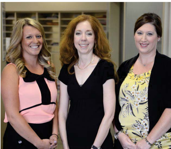
Chiropractic Associates of LVPG