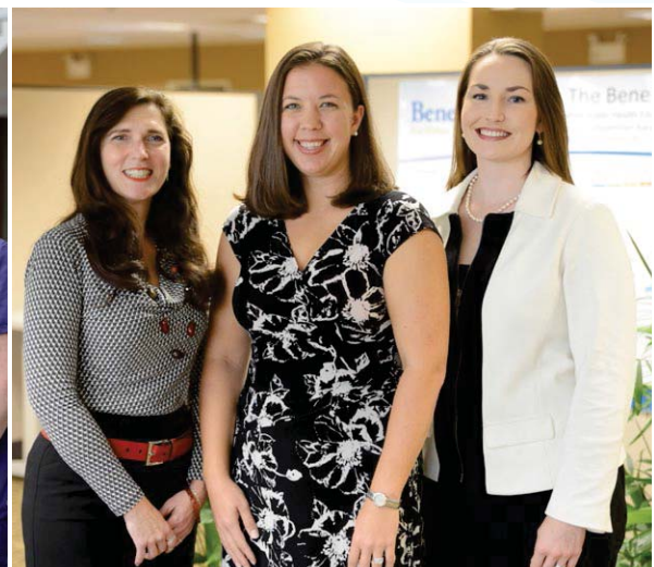
Valley Preferred BeneFIT Team

BeneFIT colleagues do such a good job teaching employees of local businesses how to live healthy, they're helping more people than ever. To provide the time and service people deserve, the team discovered ways to work more efficiently. Working with an SPPI coach, the team accomplished four things. They developed standard processes, resulting in better work flow and clearly defined roles. They made their Sharepoint site more user-friendly. A visibility wall was created to communicate their goals and progress. They established easier and faster ways to store and use equipment and materials. As a result, the team is accepting more clients and providing more services to existing clients, while cutting costs and increasing revenue.