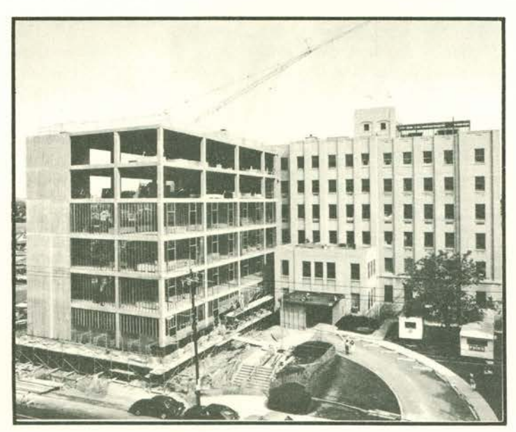
CONSTRUCTION UPDATE... A flurry of activity can be seen at the corner of 17th and Chew where workers are already laying the brick for the tower building. The steelwork is in progress for the three new patient floors over the service wing and interior work on the addition to the emergency area is being accomplished. The renovated and remodeled emergency center is expected to be completed in November, 1982.