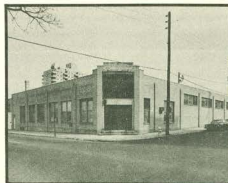
The Robbins property located at the corner of 17th and Gordon Streets.

The property has been acquired for a net purchase price of $1,200,000. With customary closing costs and interest rates the total will be $1,316,700.