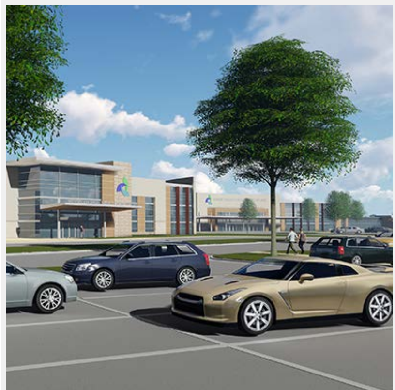
Medical Office Building

In addition to the ER, the hospital will include private patient rooms with views of the healing garden, state-of-the-art operating suites, Lehigh Valley Special Surgery Institute and Lehigh Valley Heart Institute services, a Musculoskeletal Center and more. The medical office building will provide convenient access to outpatient primary and specialty care, including breast health services, leading-edge diagnostic testing and comprehensive rehabilitation services. The campus will make it easy for area residents to get the health care services they need throughout life and throughout the continuum of care. The design of the campus also includes ample space for future growth.