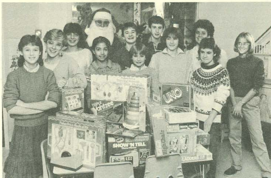
Members from Eyer Junior High School honor society and student government display a sampling of the numerous gifts which they donated to Allentown's Pediatric Unit.

Health support groups also had various celebrations. Organizations including the Peritoneal Dialysis and Home Hemodialysis Support Group,