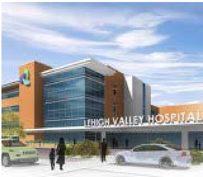
New Pavilion Will Bring Births, Rehab to LVH–Muhlenberg