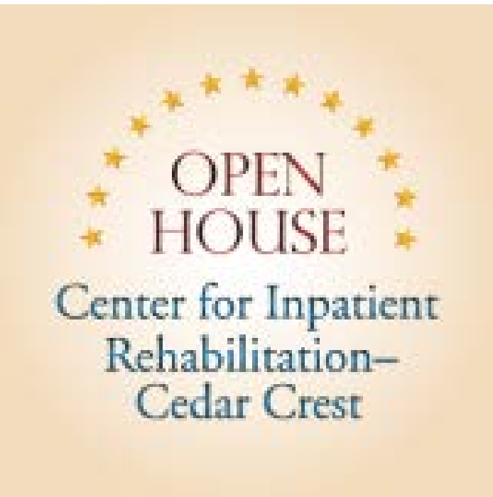
Tour the New Center for Inpatient Rehabilitation June 10-11