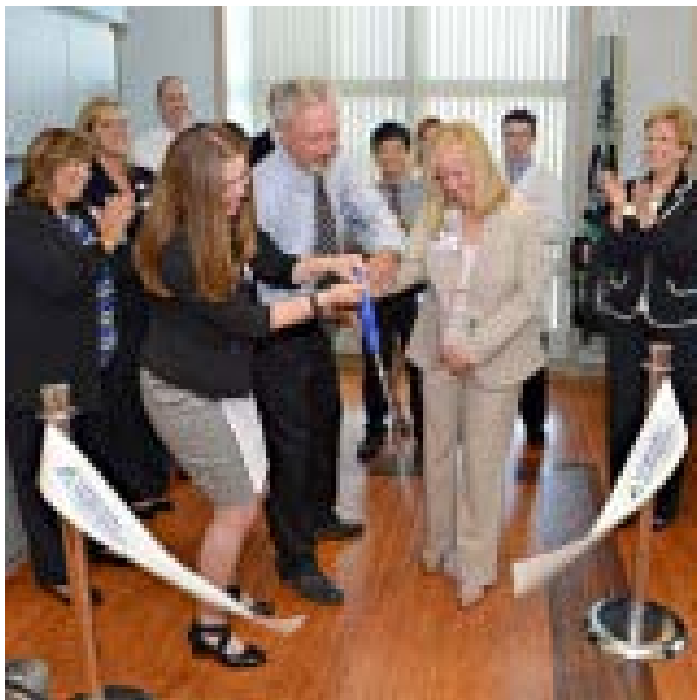
Ribbon-Cutting Ceremony Celebrates the New Center for Inpatient Rehabilitation–Cedar Crest – PHOTOS