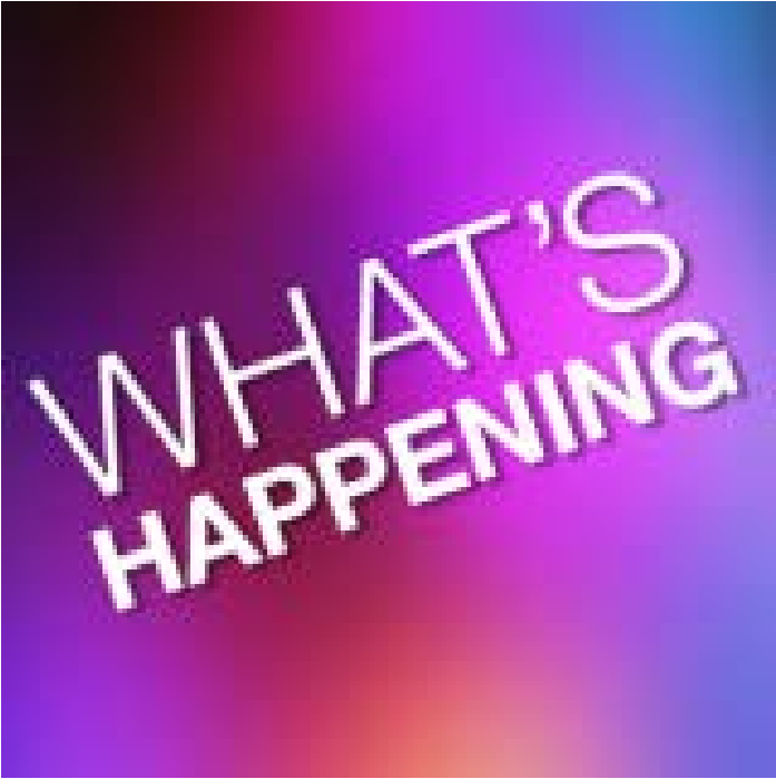
What's Happening in April 2015