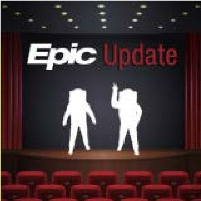
Epic Application Dress Rehearsal (ADR)