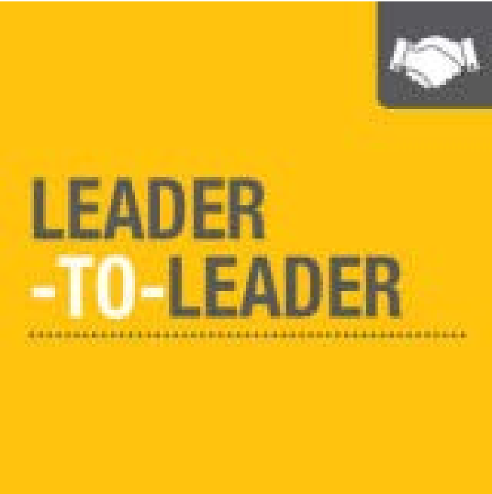
Watch June’s Leader-to-Leader Video