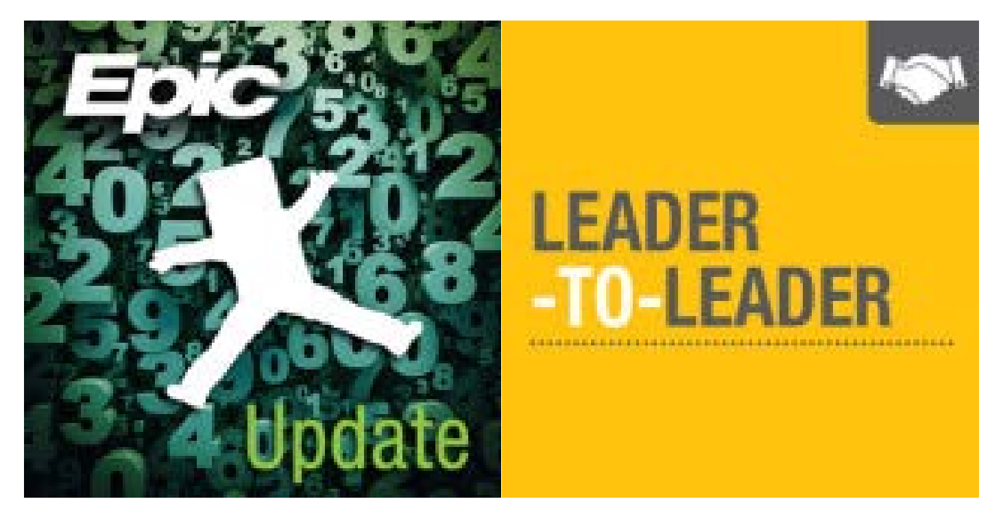
Epic Charge Capture & Reconciliation: Avoiding a $40,000,000 Loss