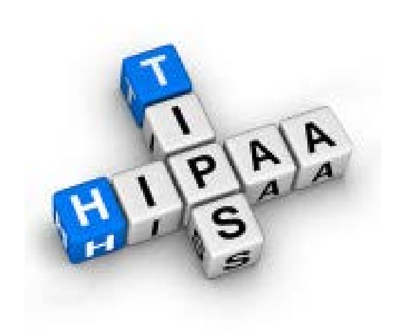
HIPAA Tip #3: Viewing Your Medical Information Properly