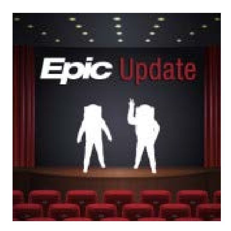
Epic Application Dress Rehearsal (ADR)