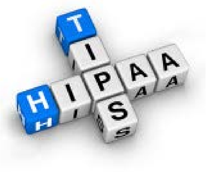
HIPAA Tip #5: Lock or Log Off Your Computer