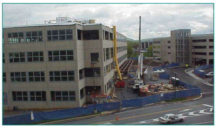
Work continues on the Center for Ambulatory Medicine. The majority of the building's windows are now in place.