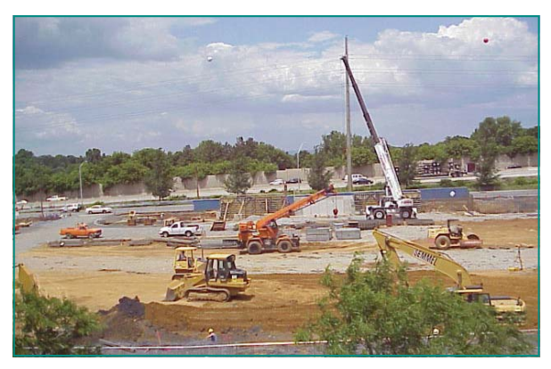
Construction continues on the first of two parking decks being built in front of the hospital.