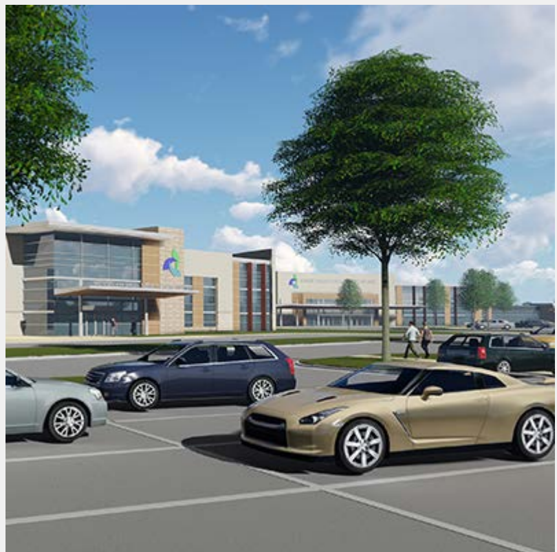
Medical Office Building

In addition to the ER, the hospital will include private patient rooms with views of the healing garden, state-of-the-art operating suites, Lehigh Valley Special Surgery Institute and Lehigh Valley Heart Institute services, a Musculoskeletal Center and more. The medical office building will provide convenient access to outpatient primary and specialty care, including breast health services, leading-edge diagnostic testing and comprehensive rehabilitation services. The campus will make it easy for area residents to get the health care services they need throughout life and throughout the continuum of care. The design of the campus also includes ample space for future growth.