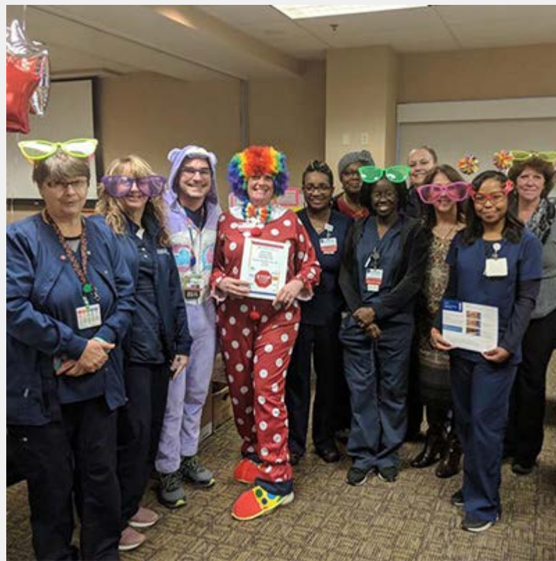
Last year's team takes a lighthearted approach to a serious medical issue, while raising awareness about pressure injuries.

The skin care team will provide poster presentations, and there will be a photo booth and healthy snacks for colleagues to enjoy. It is important to note that there have been no pressure injuries at LVH–Pocono since May 2019.