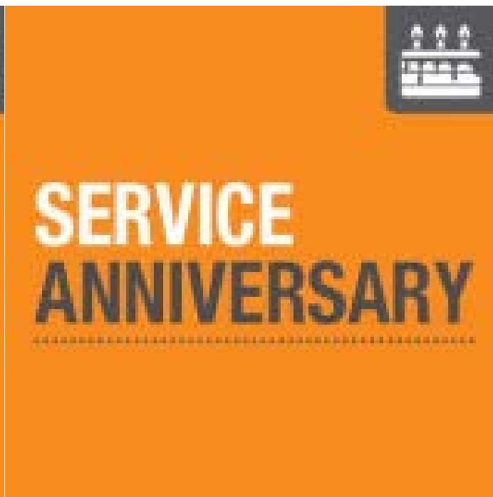
Service Anniversary List – November 2015