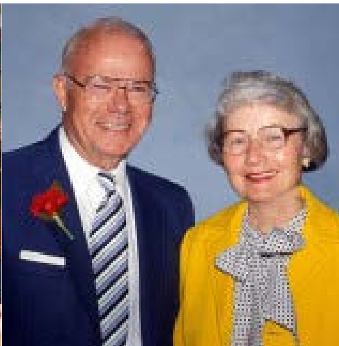
His Gift Pays Tribute to His Wife's Journey With Dementia – VIDEO