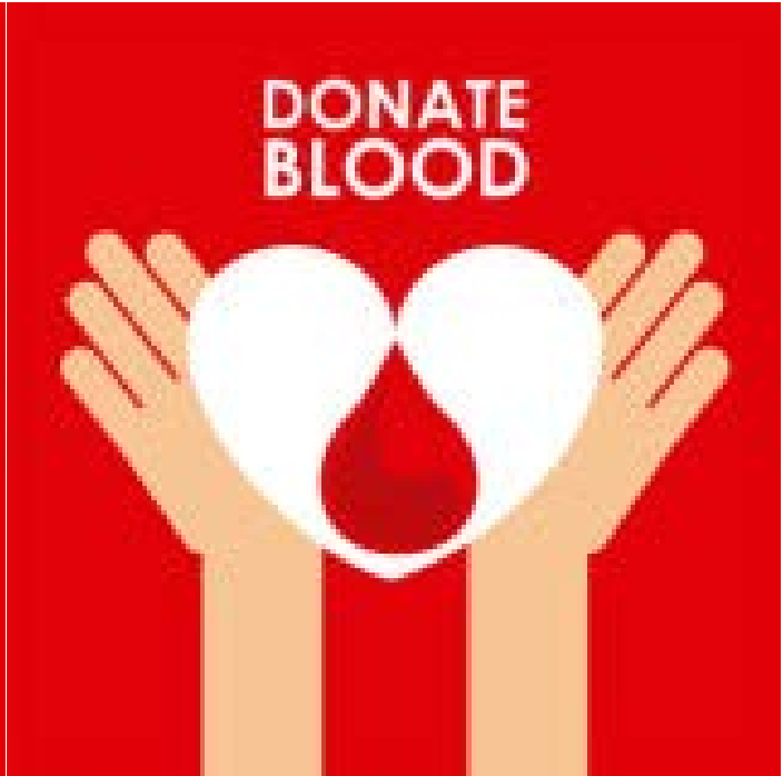
Give Blood in November 2015