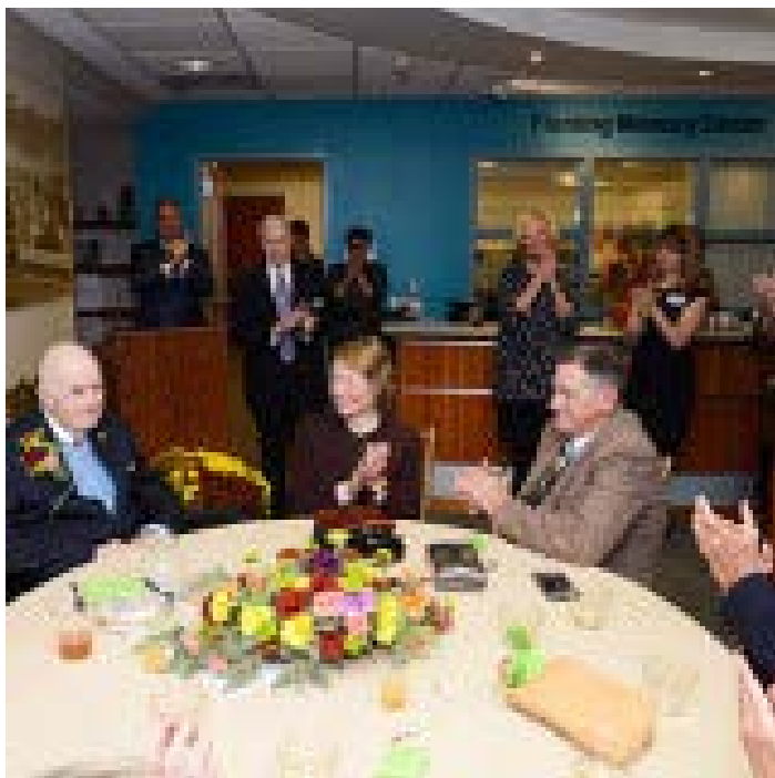
Fleming Memory Center: A New Resource for Patients With Dementia and Their Families—PHOTOS