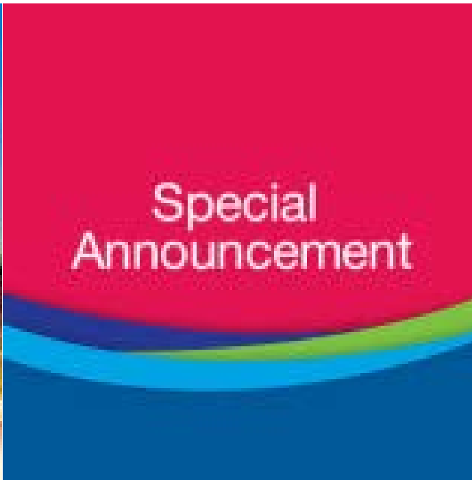
Charitable Mission Hearing