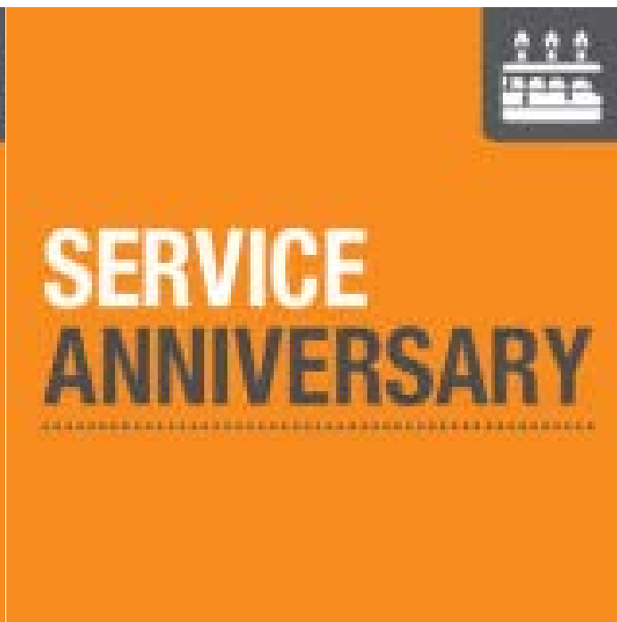
Service Anniversary List – December 2015