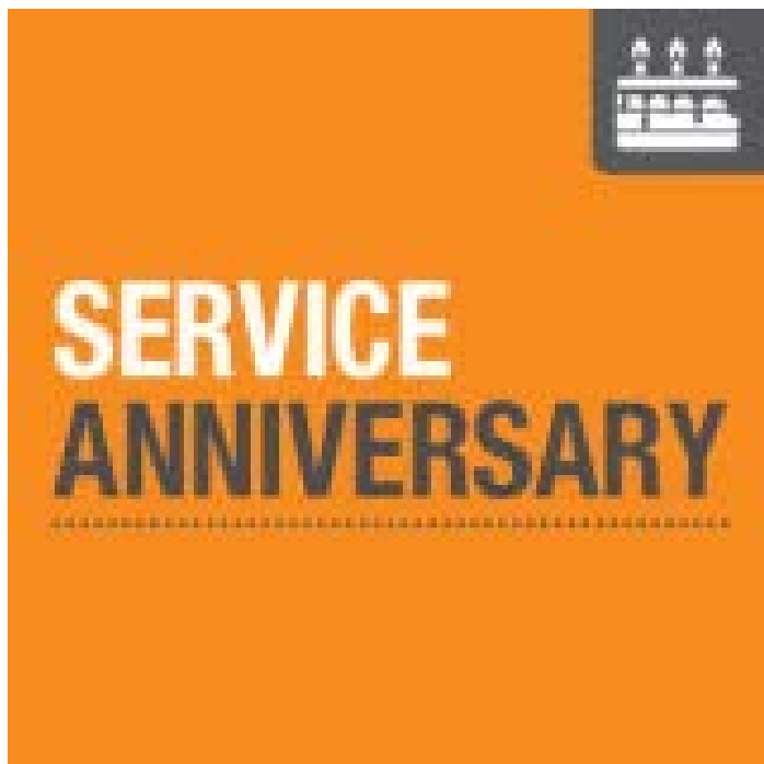
Service Anniversary List – January 2016