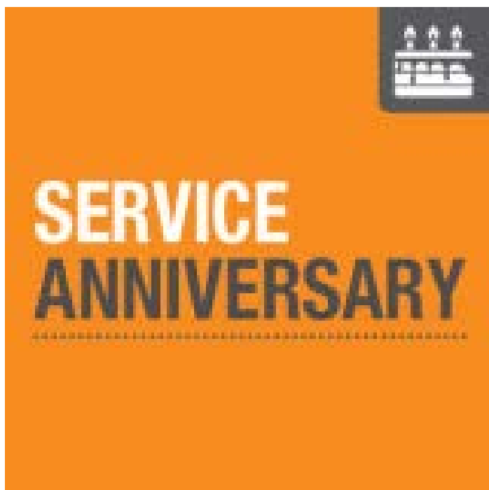
Service Anniversary List – November 2015