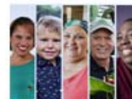
Community Annual Meeting