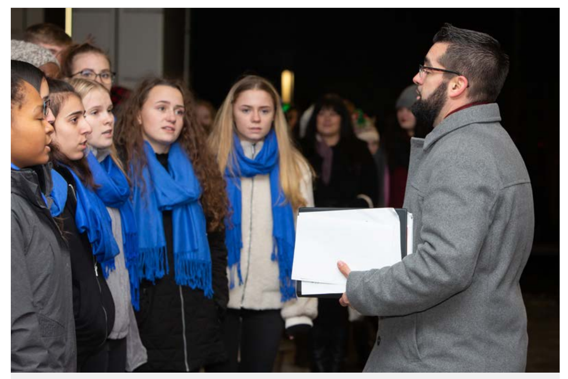
Area students singing at the Annual Holiday Tree Lighting

The funds awarded are raised by selling bulbs in honor or in memory of loved ones and local businesses sponsor Christmas trees and purchase advertising in the program booklet. All funds raised are given back to community non-profits.