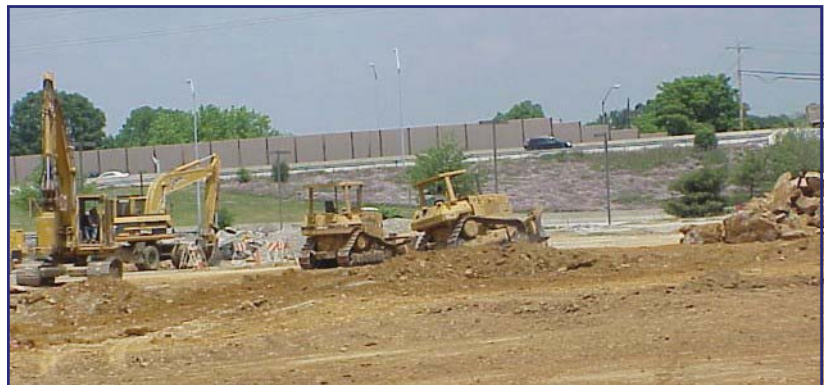
Bulldozers and other construction vehicles prepare the site on the east side of the Cedar Crest & I-78 campus for the new medical office building and five-story parking deck.

The road looping around LVH-Cedar Crest has changed. To prepare for the new seven-story tower (which will be adjacent to the current Anderson Wing), the former loop road in front of the loading docks is closed indefinitely. Traffic is now being routed on the south side of the Children's Early Care and Education Center and through Parking Lot 11. Also, work is continuing on the new medical office building and five-story parking deck on the east side of the campus.