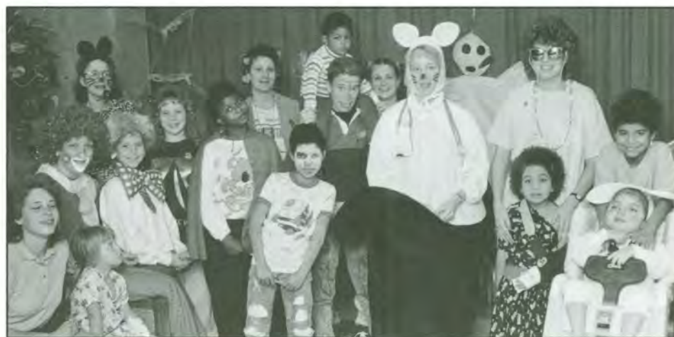
Pediatric nurses and patients look frightening in their Halloween finery.