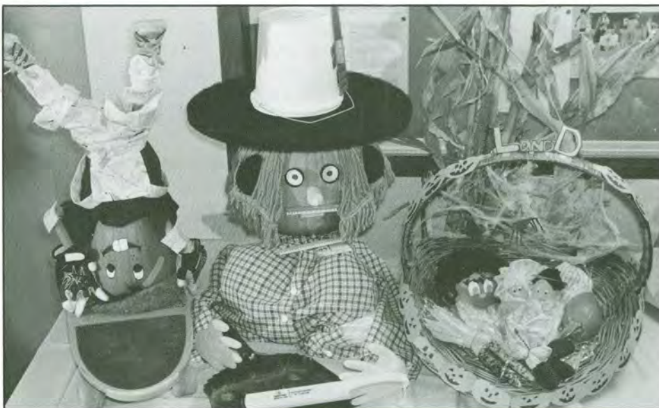
Employees demonstrate their creativity through their entries in the pumpkin decorating contest, including the first place winners at TAH site shown above.