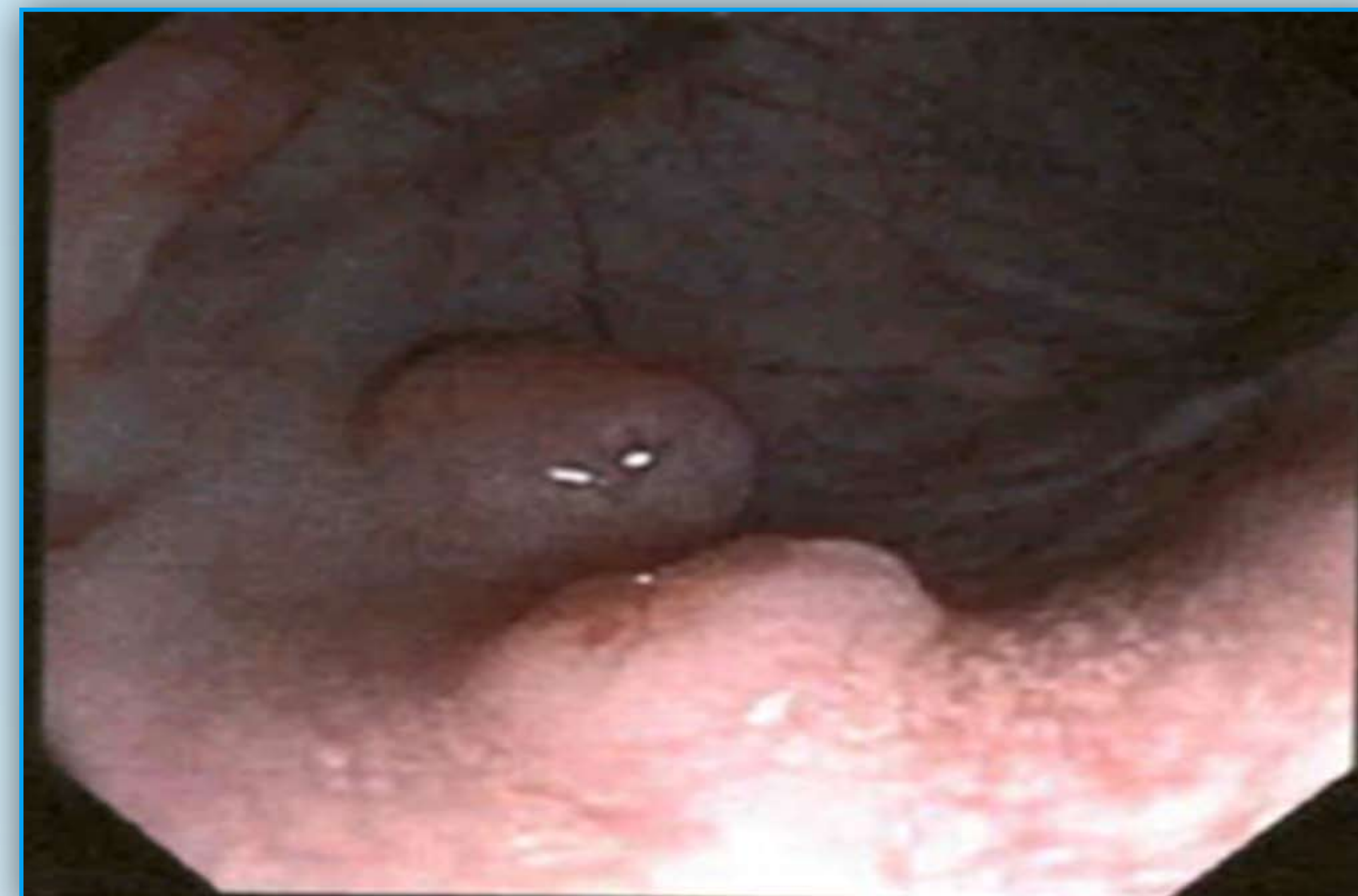
Polyps seen on endoscopy