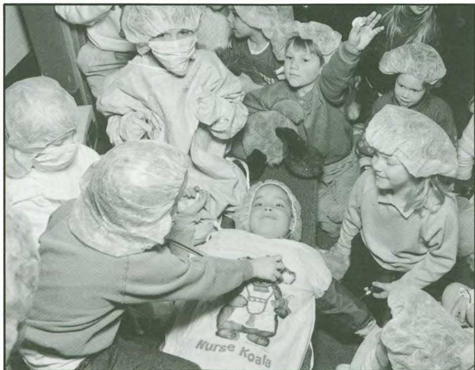
Children In Hospitals Week - Related Story On Page 5

Volunteers strengthen caring into commitment and commitment into action.