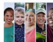
Community Annual Meeting