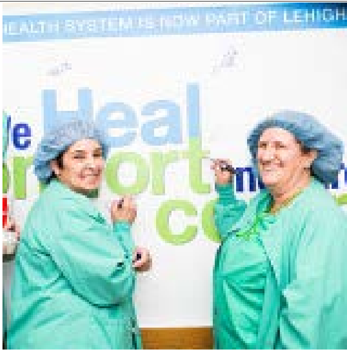
Celebrating the Pocono Merger – PHOTOS and VIDEO