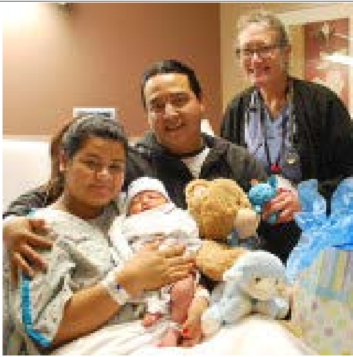
'Amazing' Day for Parents of First Baby Born at LVH–Pocono