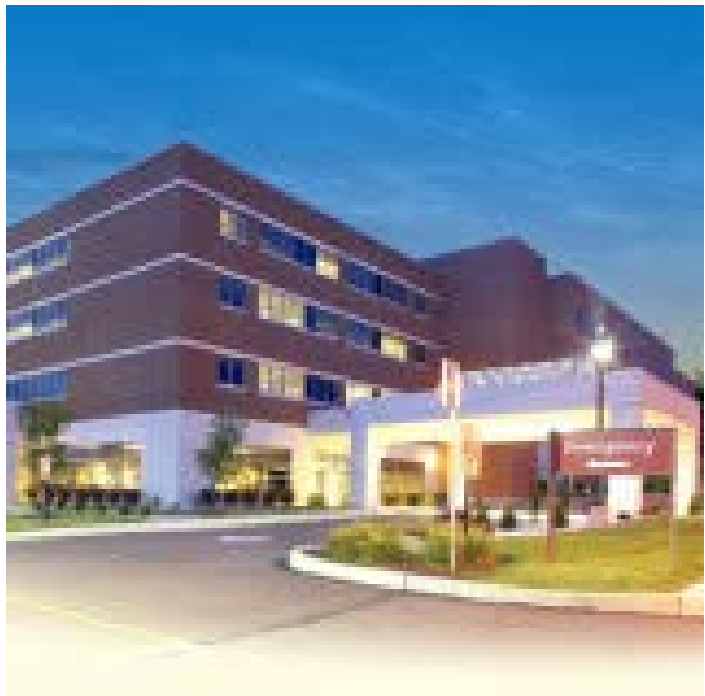
Pocono Health System Will Become Part of LVHN on Jan. 1