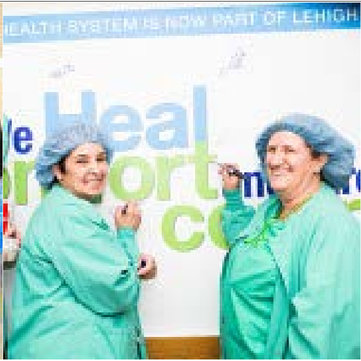
Celebrating the Pocono Merger – PHOTOS and VIDEO