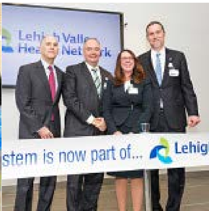
Pocono Health System is Now Part of LVHN