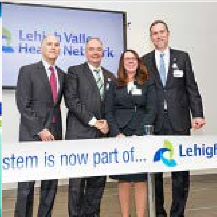
Pocono Health System is Now Part of LVHN