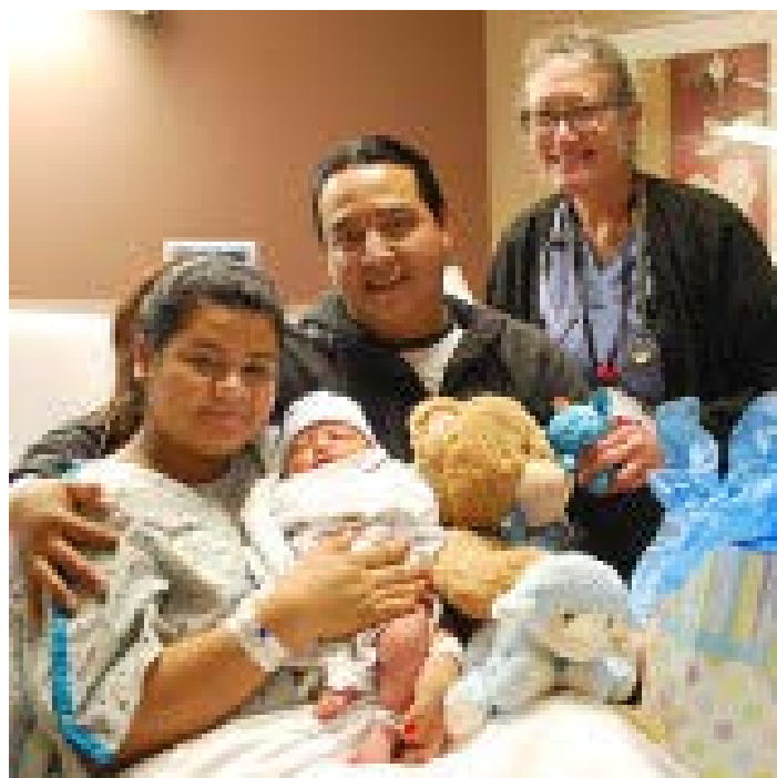
‘Amazing’ Day for Parents of First Baby Born at LVH–Pocono