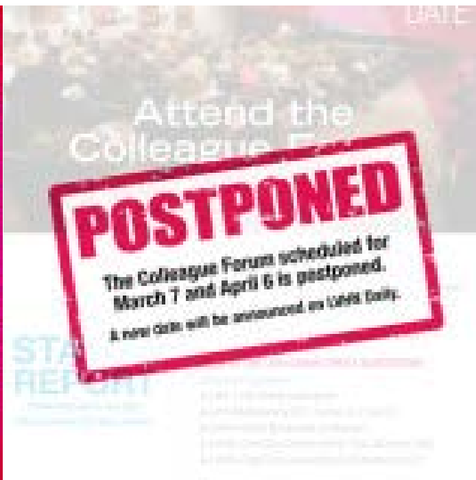
Colleague Forum Postponed