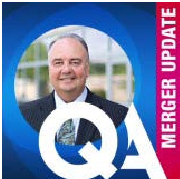
Q&A: What Is the Latest News on our Mergers?