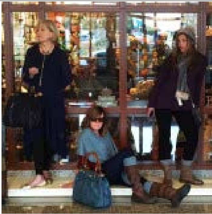
Live Models Coming to Gift Shops