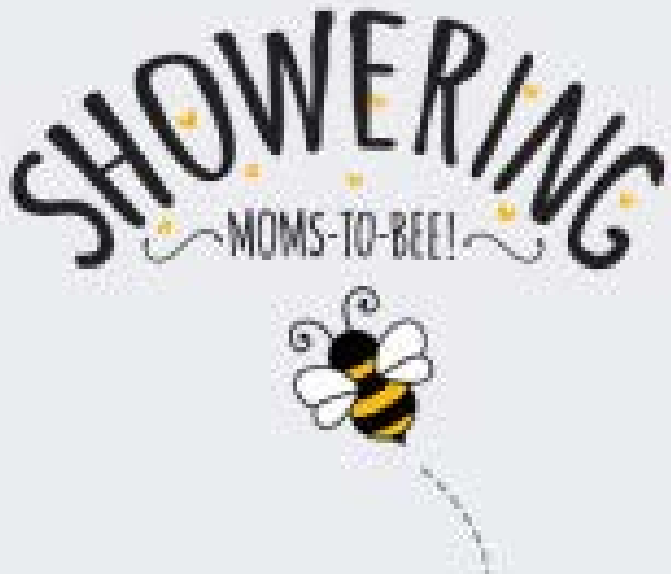
Moms to "Bee" Invited to Community Baby Shower