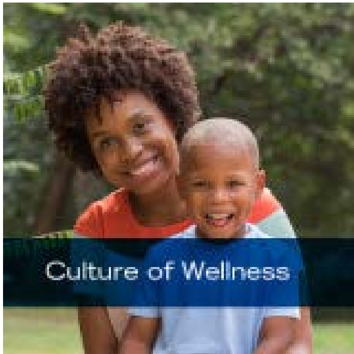
April Culture of Wellness Opportunities for Raising a Family