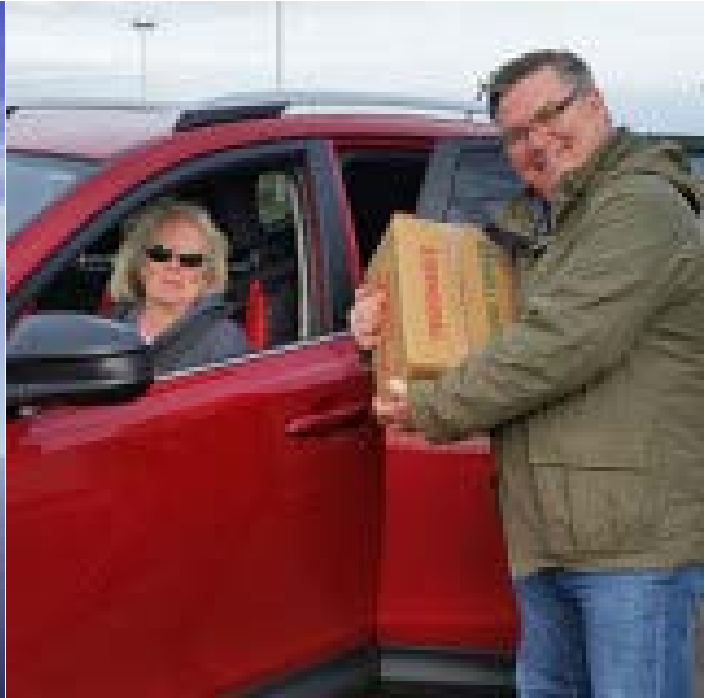
Colleagues Gobble Up More Than 5,000 Turkeys at Turkey Toss – PHOTOS