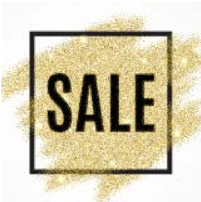
April Sales Set for LVH-Muhlenberg, LVHN-Mack Boulevard