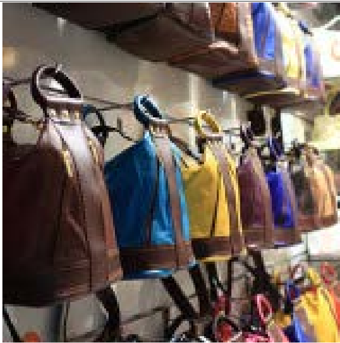
Purse Sale at LVH–Cedar Crest Feb. 14 and 15