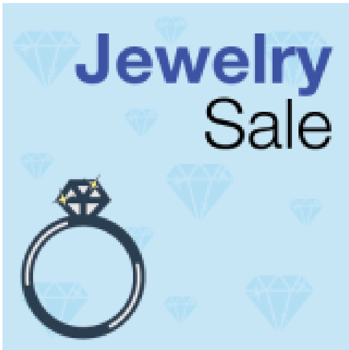
Four $5 Jewelry Sales at LVH–Cedar Crest in December