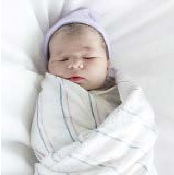
First Baby Arrives at the Family Health Pavilion at LVH–Muhlenberg – Photos