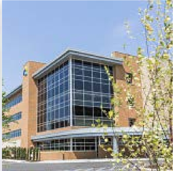
Parking Changes at LVH–Muhlenberg You Need to Know