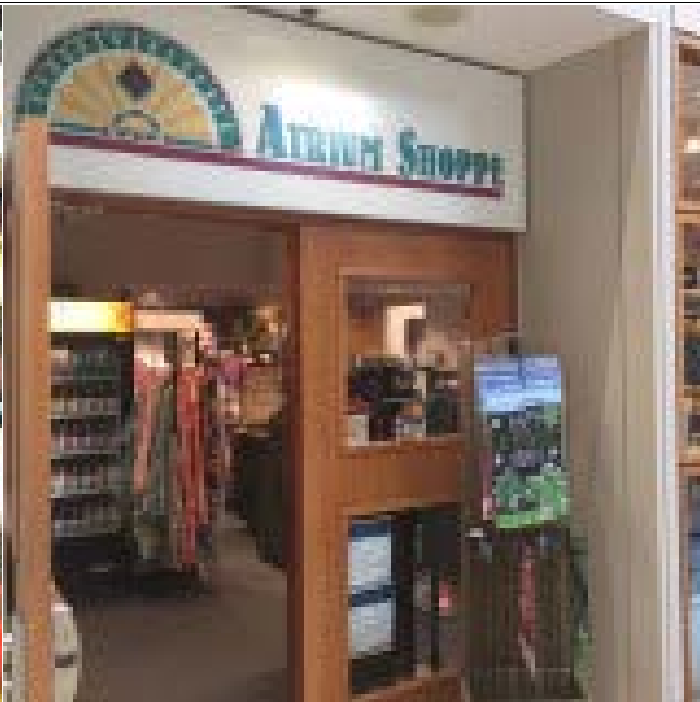
Sales Marks 20th Anniversary of Atrium Gift Shop