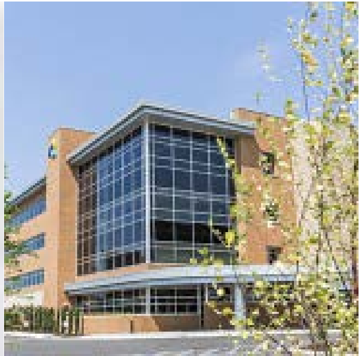
Parking Changes at LVH–Muhlenberg You Need to Know