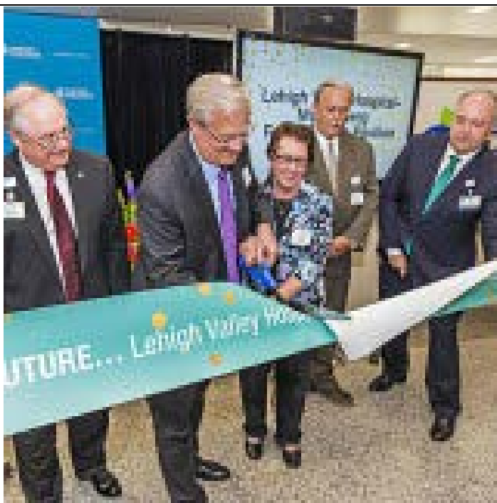
Friends, Colleagues Celebrate Arrival of Family Health Pavilion at LVH–Muhlenberg