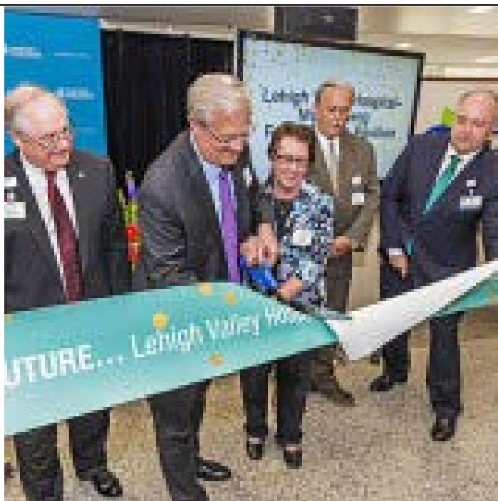
Friends, Colleagues Celebrate Arrival of Family Health Pavilion at LVH–Muhlenberg