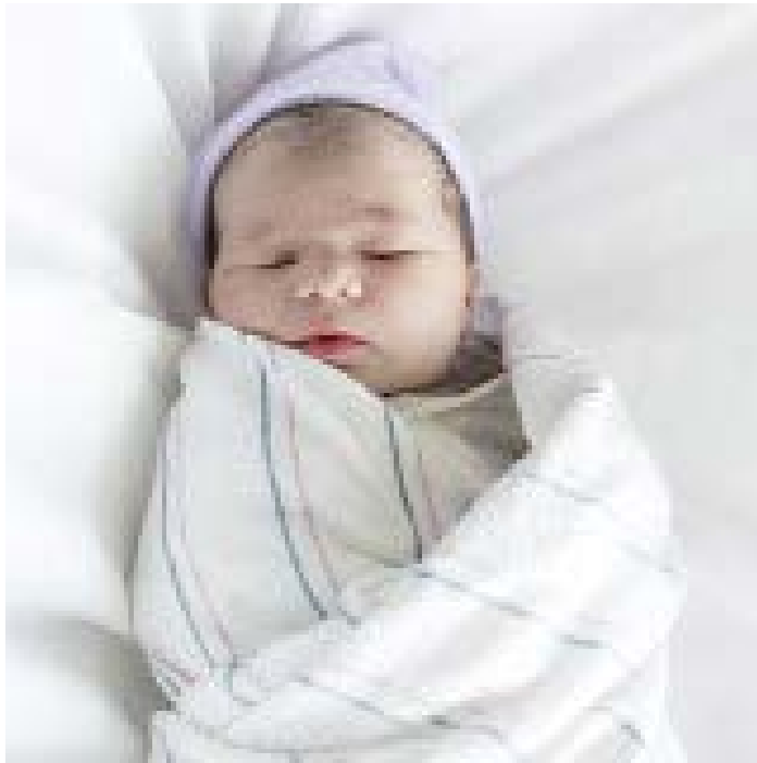
First Baby Arrives at the Family Health Pavilion at LVH–Muhlenberg – Photos