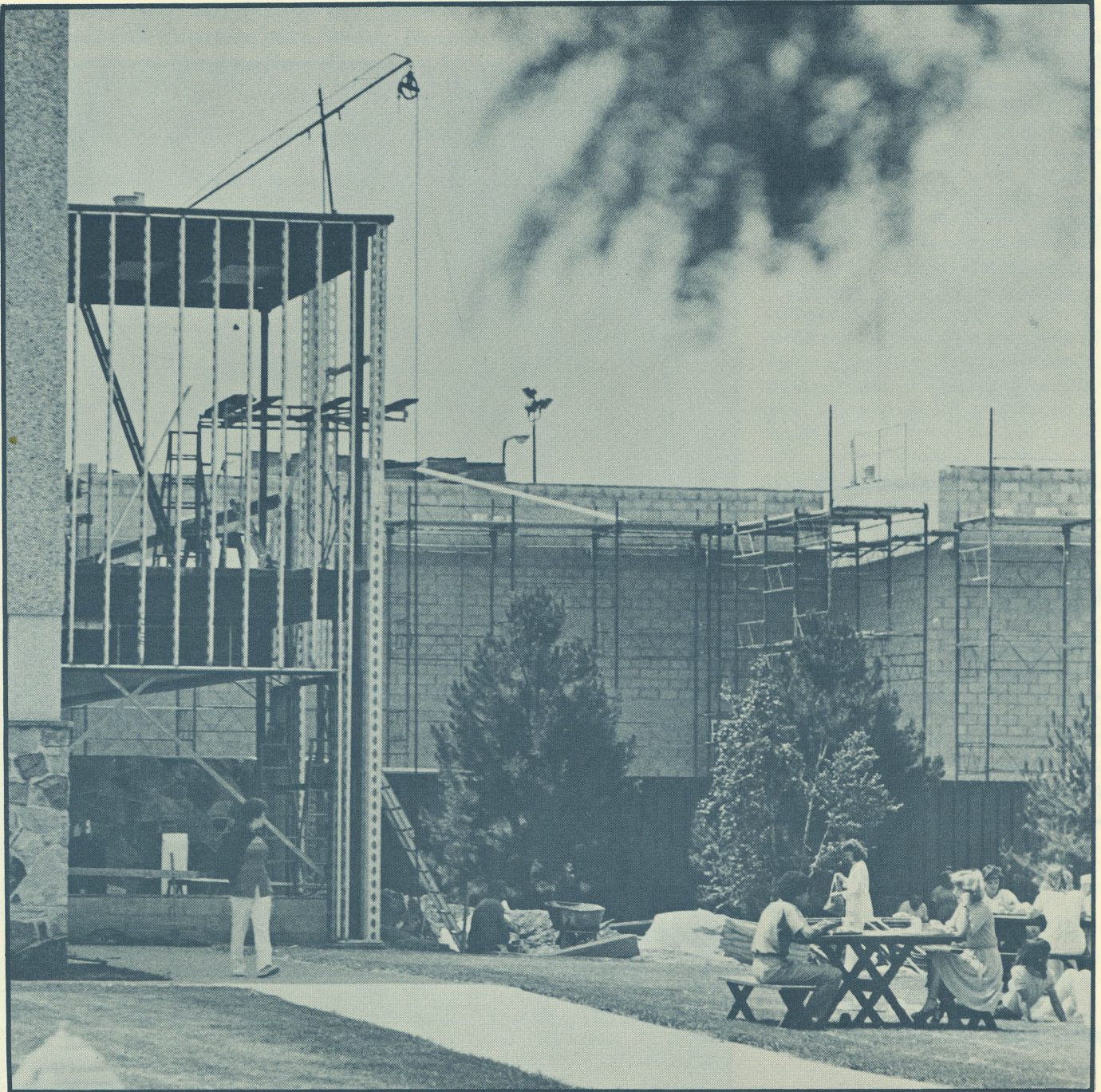
Summer's arrival means more employees enjoying lunch outside — undaunted by dining room expansion, left, General Services Building construction, right, and creating a second floor walkway to it.