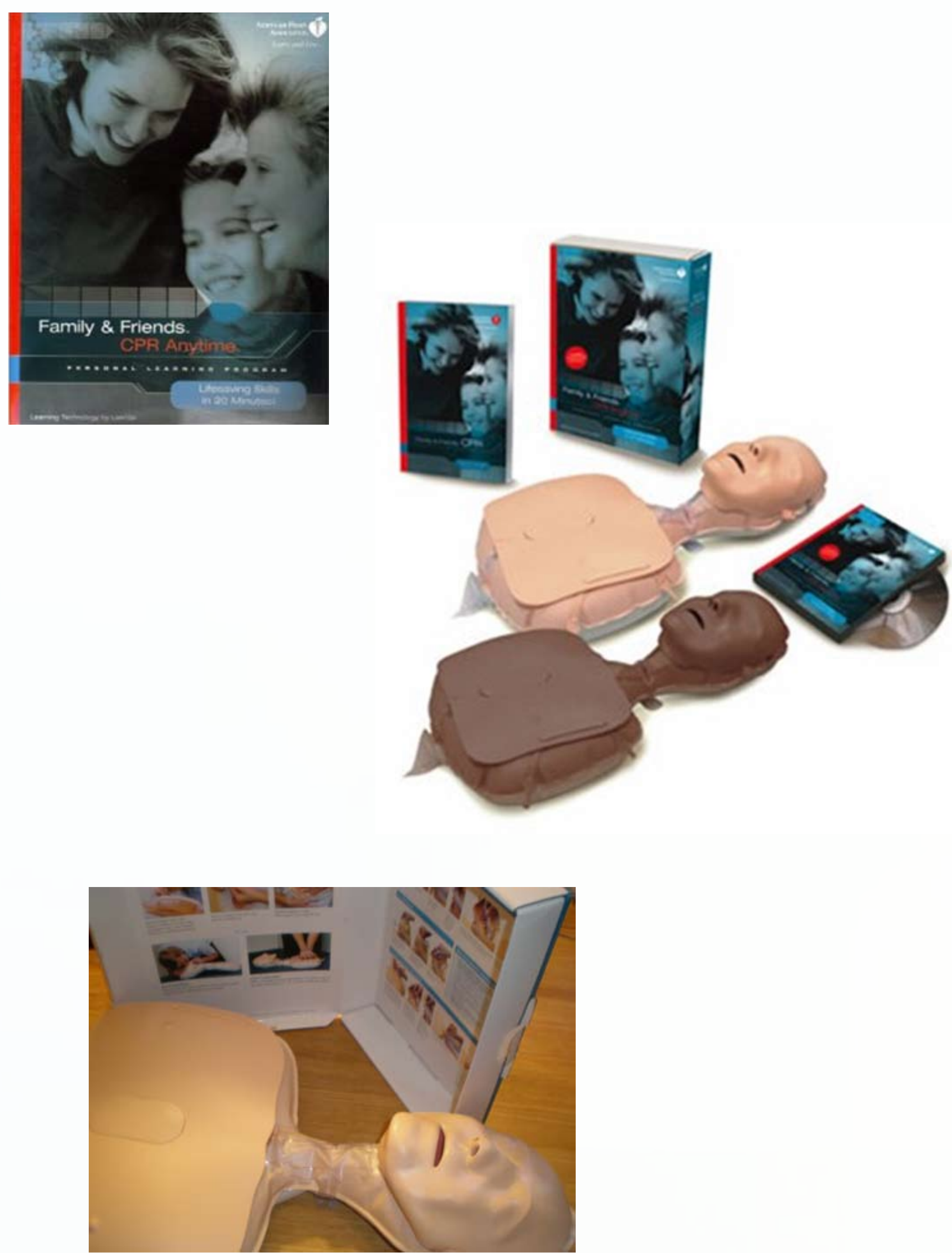
CPR Treatment Kit Family and Friends