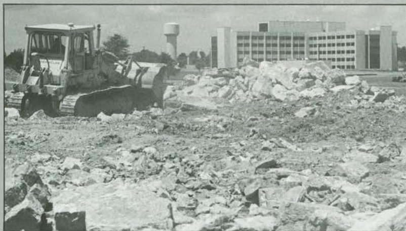
Pictured above are a few of the rock piles which were donated to fill the sinkhole in the Borough of Macungie.