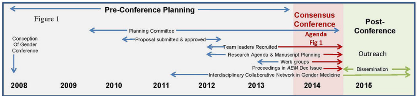
Figure 1. Timeline for the 2014 AEM consensus conference: planning, execution and dissemination.