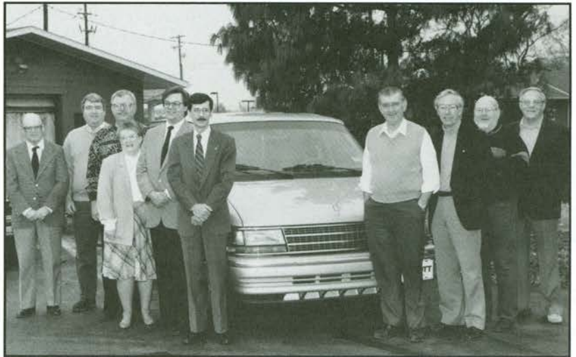
Members of Kiwanis Divison 18 and their lieutenant governor pose with a new van, leased to TAH—LVHC for transporting women in the "A Better Start" program. As a Major Emphasis project, the group funded the van for a period of three years.

For the benefit of all employees a "User's Guide" to the new identity will be distributed the week of March 16. It begins to cover all identity issues and should be retained as a reference source. The guide is designed to hold updates and other identity-related items.