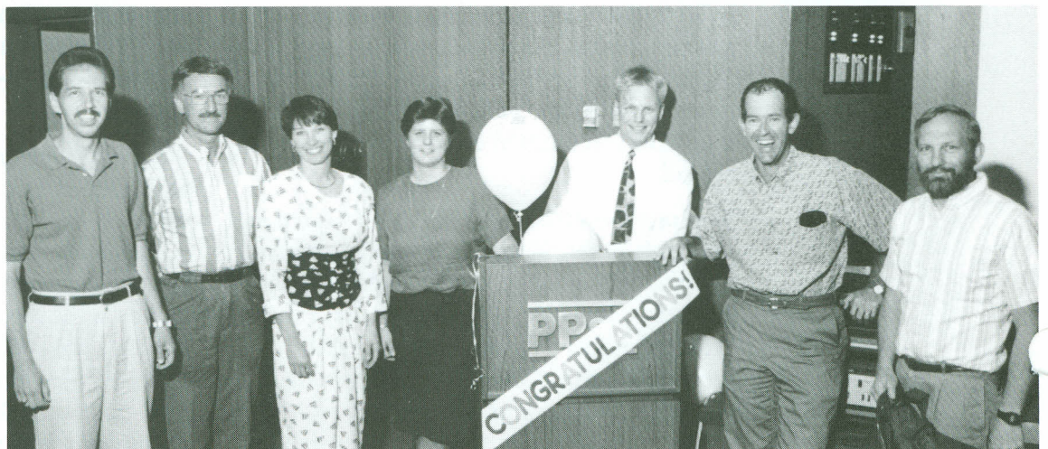
PP&L's winning team in the Health Promotion and Disease Prevention Department's "Lean On Me" program.