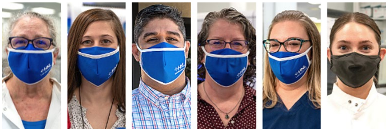
HNL Lab Medicine Unseen Heroes

Thank you for your partnership in attracting the best and brightest health care professionals to LVHN.