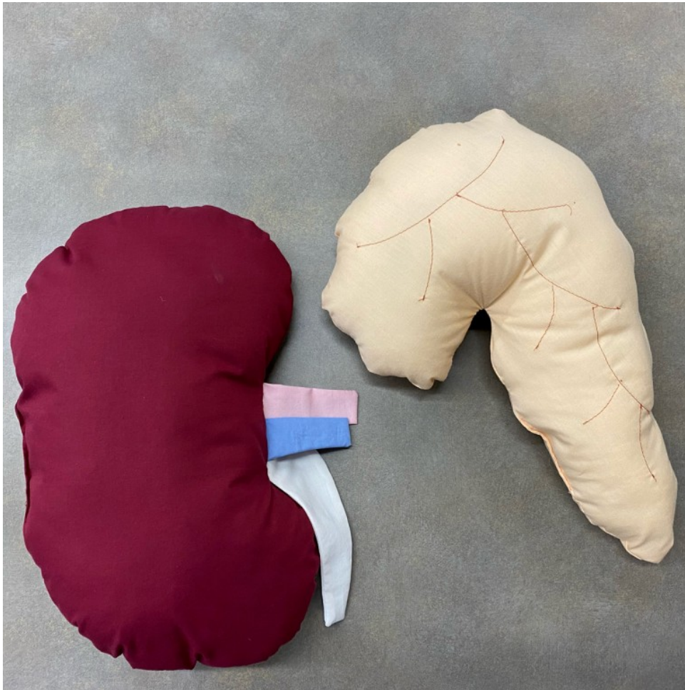
Kidney and pancreas-shaped pillows

Eckhart has been a nurse with LVHN for 36 years, the first 26 as a medical-surgical nurse. After surgery, nurses typically give a patient a folded blanket, taped so it stays folded, to patients to hold over their incision to support it when they need to move, take deep breaths or cough. The technique is called splinting.