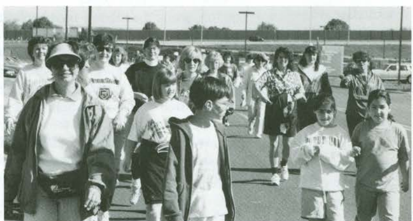
Warm-up exercises were a prerequisite to the Family Fun Walk that kicked-off the May Daze weekend. Others, of course, chose to ride it out while many were content to "clown around" or browse in the used books tent.