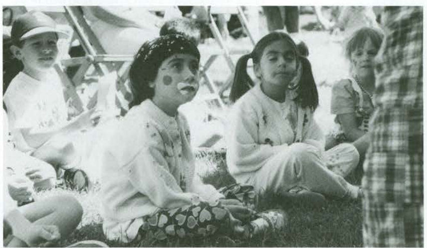
May Daze 1994