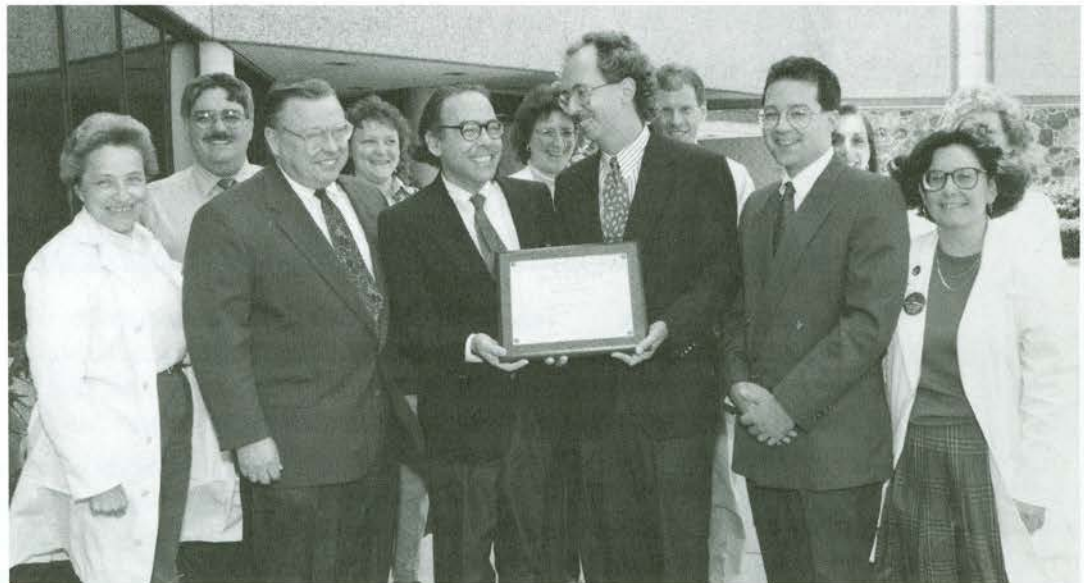
The Delaware Valley Transplant Program recently recognized staff members of Lehigh Valley Hospital for their commitment to saving lives through organ and tissue donation. Last year, 38 families consented to organ and tissue donations which benefitted area patients through kidney, heart, liver, pancreas, cornea, bone and skin transplants.

"It's not only a service that our patients appreciate, but also one that our staff interpreters find rewarding," she says. ■