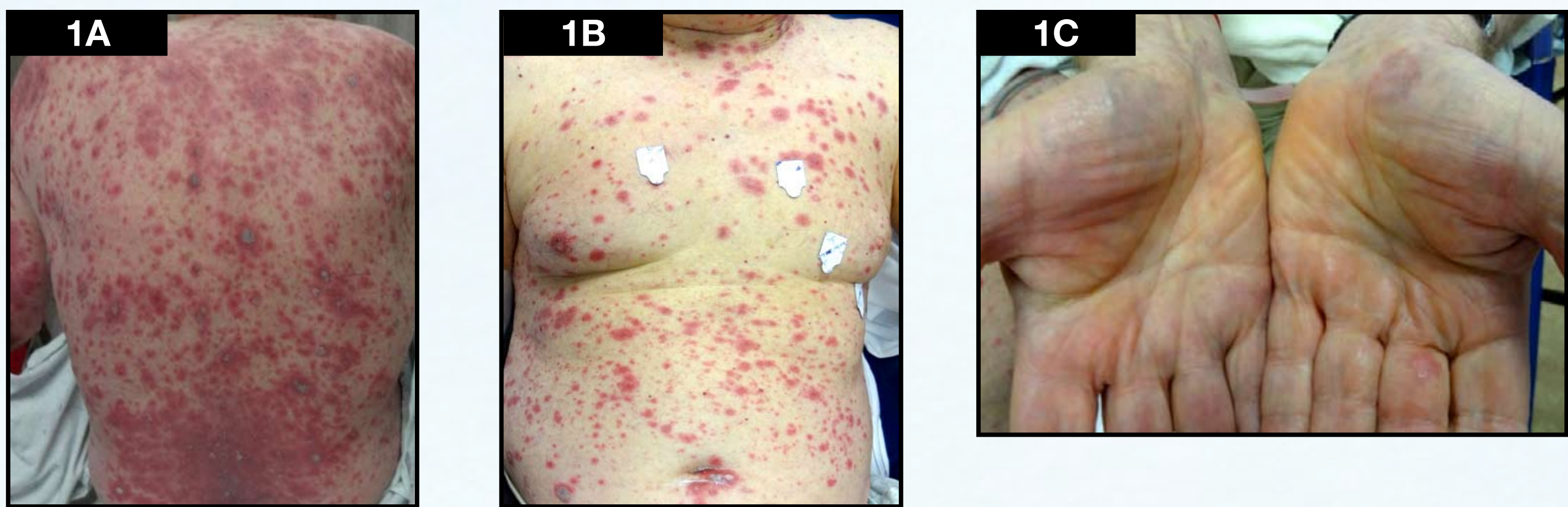
Figure 1 (A-C): (A & B) Multiple erythematous thin scaly papules, some with targetoid appearance, coalescing into plaques noted on the neck, ears, back, chest and arms. (C) Thin, red, annular plaques on the palms.