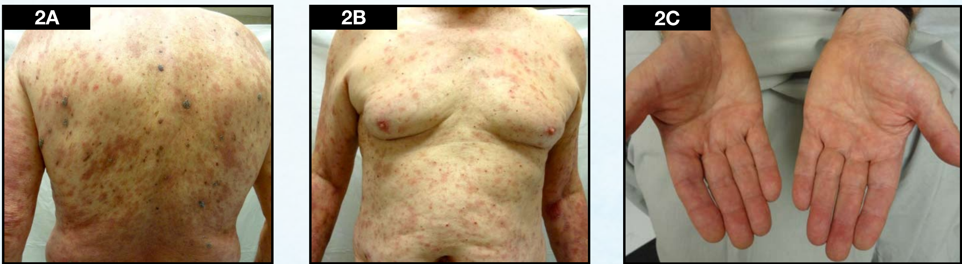
Figure 2 (A-C): Significantly reduced erythema and size of lesions after treatment with prednisone and Plaquenil.