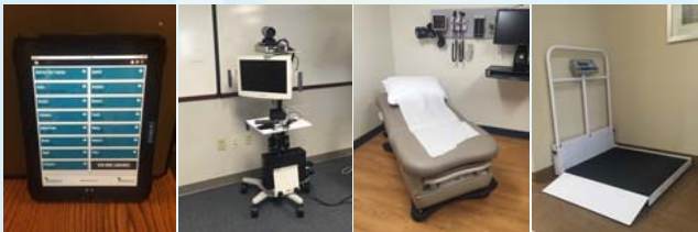
iPad with STRATUS app Tandberg "George" unit Adjustable Exam Table Wheelchair Scale