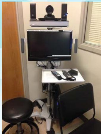
Fig 2: Shivani Desai, June 21 2016, Telestroke Mobile Telemedicine Unit: Hazleton ED