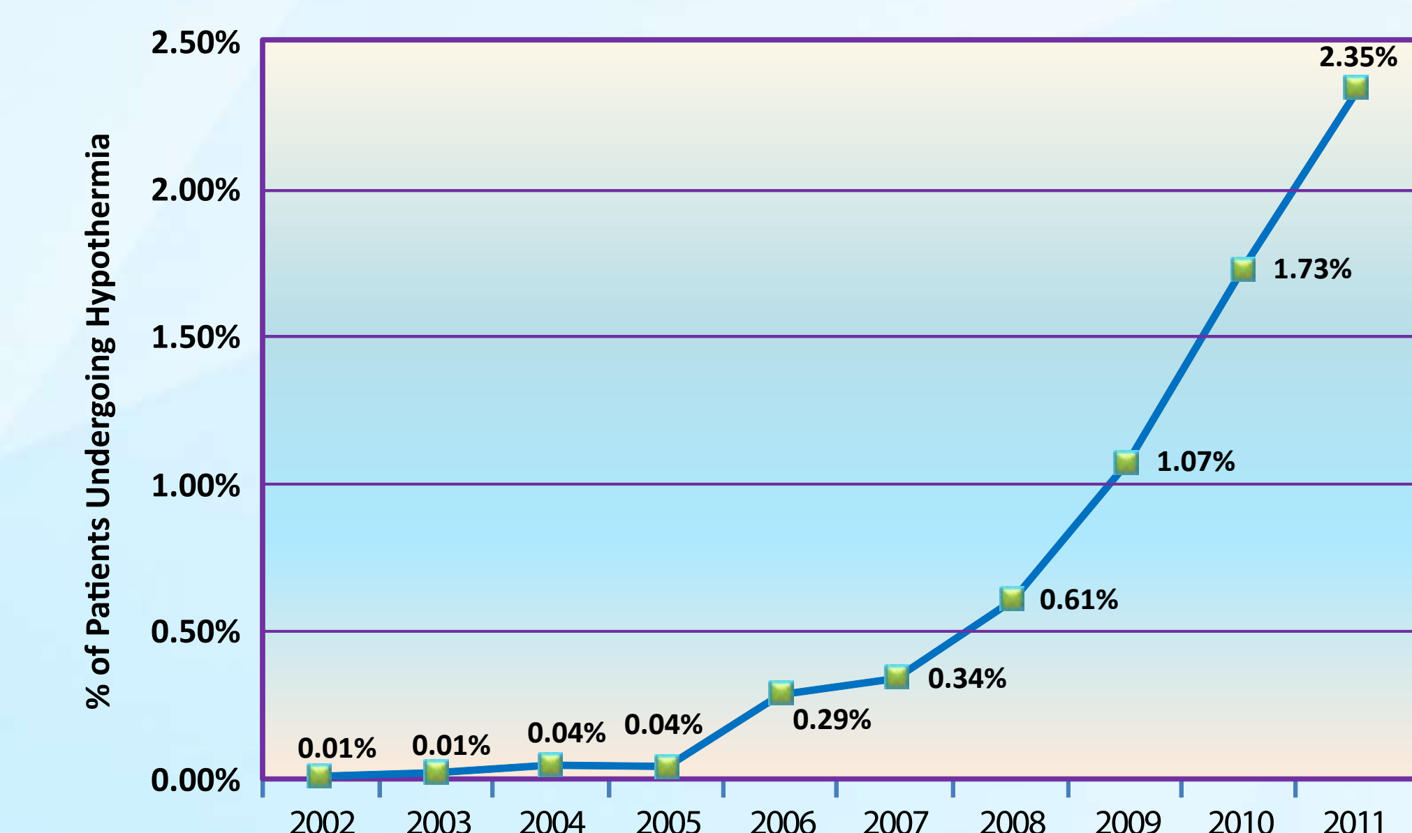
Figure 1: Trend of therapeutic hypothermia utilization from 2002-2011 (p<0.001)