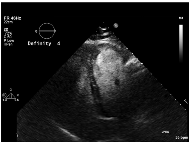
Image B. Apical 4-chamber view on 2D echocardiogram following intravenous definity contrast demonstrating apical thrombus.

The authors report no conflict of interest.