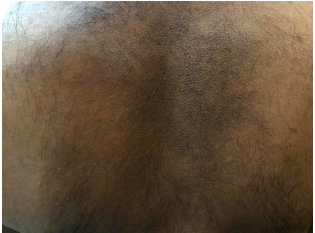
FIGURE 2: Disappearance of urticarial wheals after treatment

weeks after therapy was started (Figure 2).